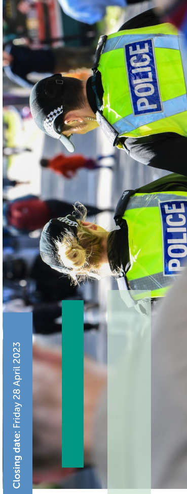
Closing date: Friday 28 April 2023