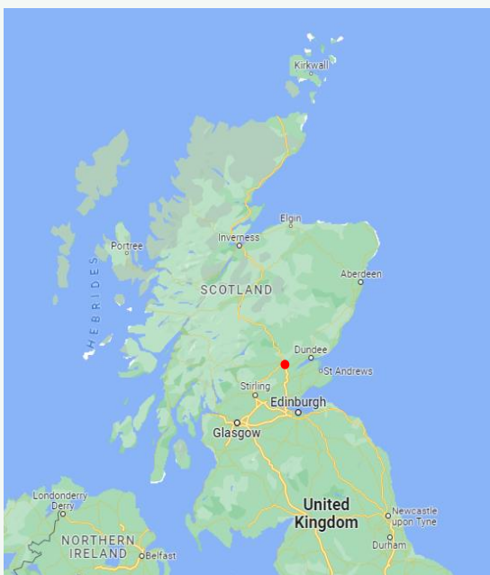
Above – Location of Letham - Google Maps, 2023

The average percentile ranking across all the data zones in Perth and Kinross is 62. This means that Letham is classed as deprived in the SIMD when compared to Perth and Kinross.