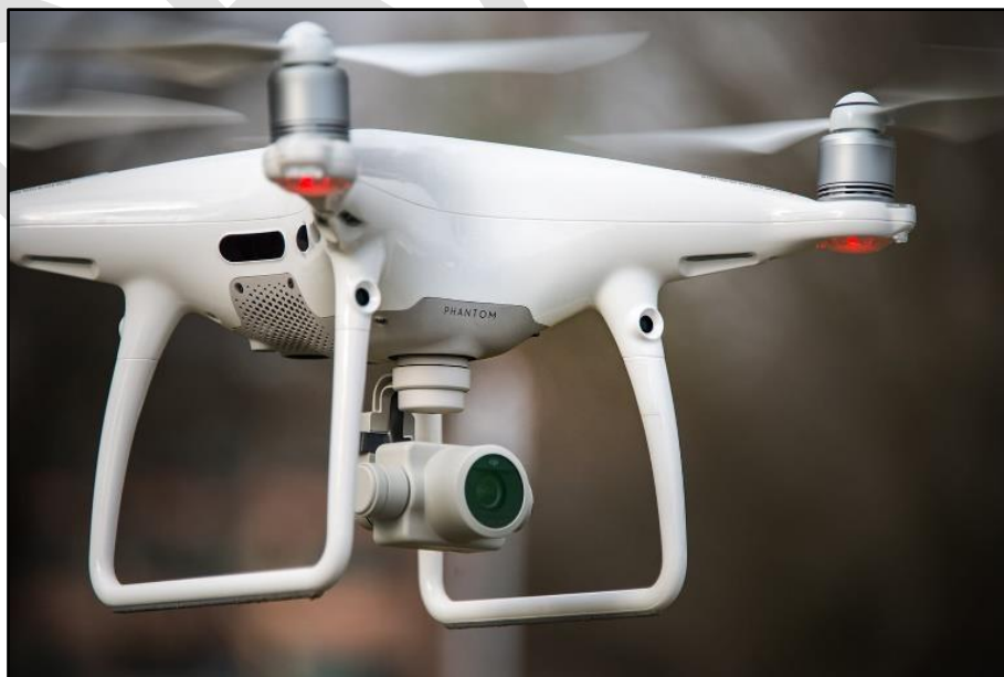
DJI Phantom 4